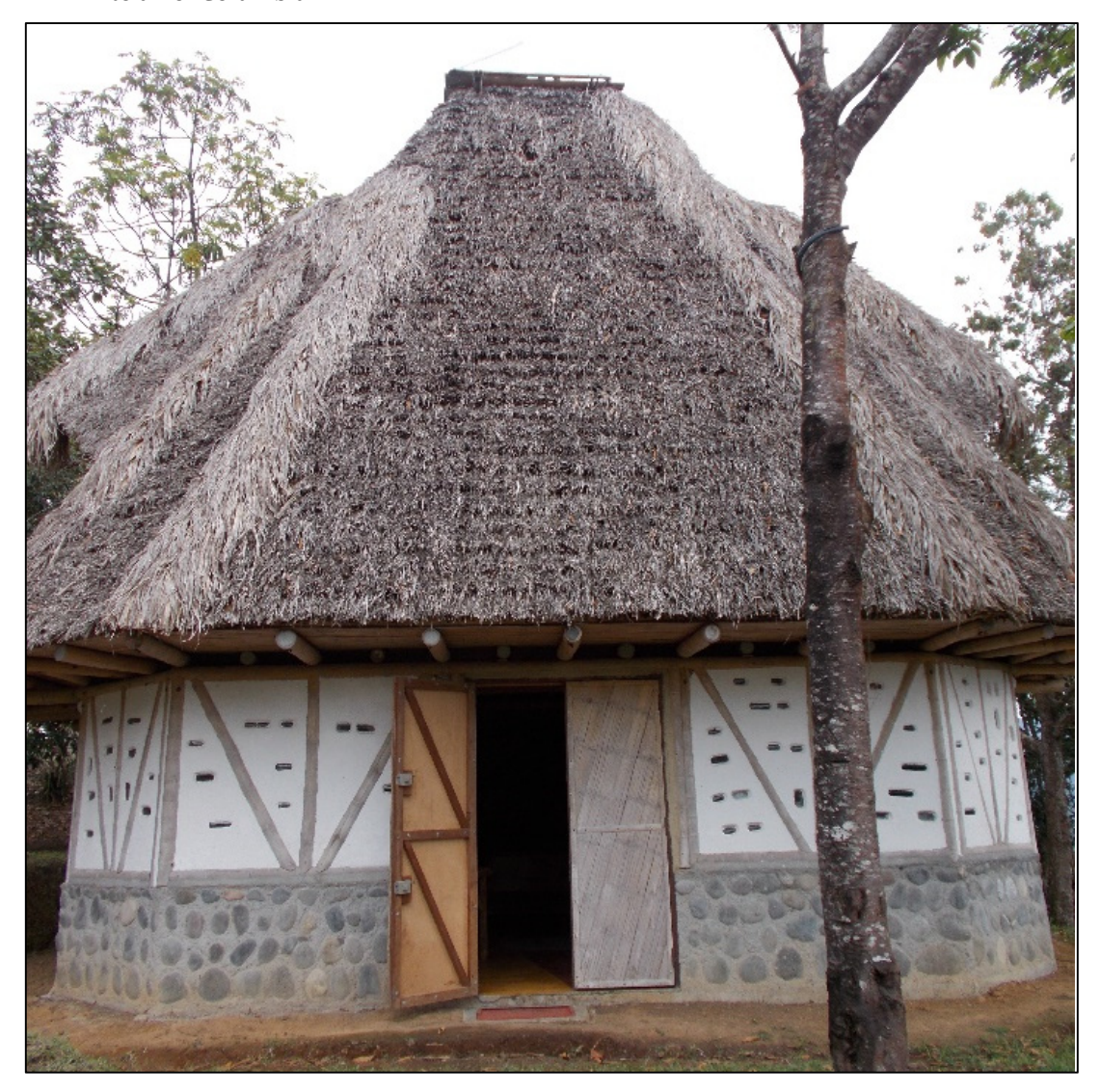
Figure 2: A casa de semillas

3) Declaration of non-GMO zones (banning genetically modified seeds): Indigenous communities in the Colombian Caribbean and coffee region have made use of their special indigenous jurisdiction to legally declare non-GMOs zones. The special indigenous jurisdiction is a legal mechanism established in article 246 of the 1991 Colombian Constitution, by which indigenous communities have the authority to apply their own regulations in their territories. The use of this mechanism has made it possible for them to ban genetically modified seeds (threat number three in the NGOs diagnostic) in their territories. Peasant communities do not have this right but, with the assistance of an NGO that specialises in providing legal advice, Red de Semillas is seeking to expand this tactic to all of Columbia.