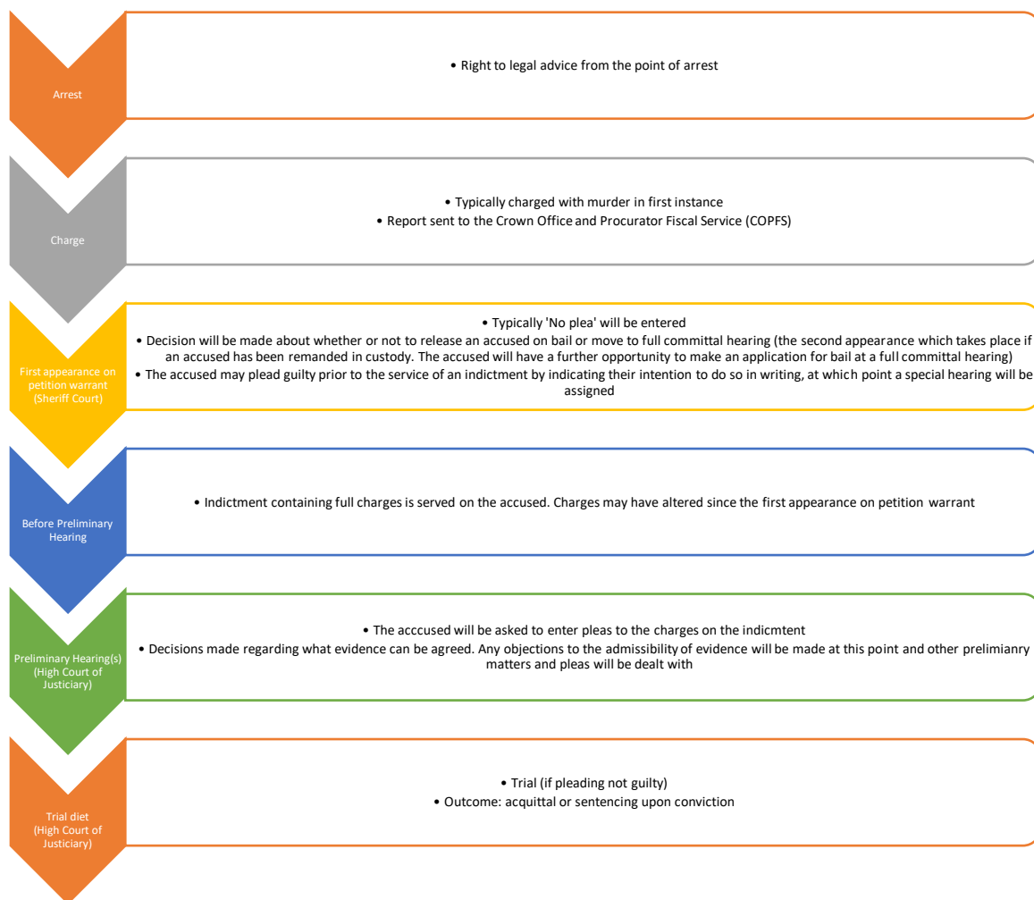
Figure 1. The criminal justice process for a person accused of a homicide in Scotland